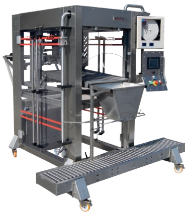
Bag-in-box filling machine DOSITEC