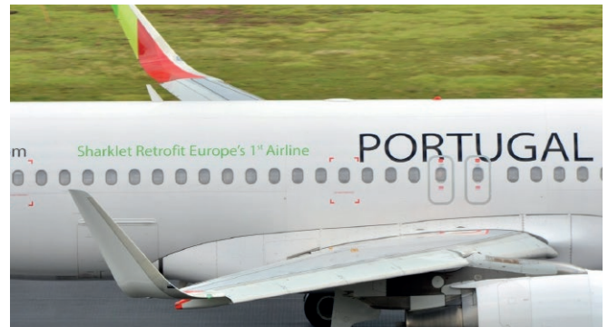
A320 With the Wing Sharklet

All these distinctions translate to the exceptional acknowledgment level reached by the company in optimizing and use of the fleet and maintenance of its operational reliability.