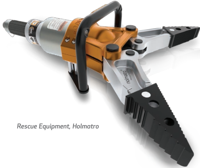
Rescue Equipment, Holmatro

The complete 3D CAD solution for designing better products