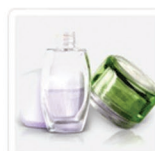
Health and Beauty