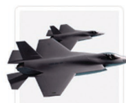
Aerospace / Defense